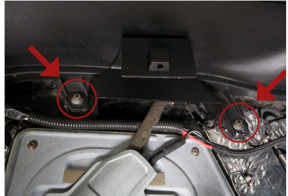
Bracket installed – side view